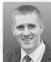
Igor Lukšić Montenegro's former Prime Minister and Foreign Minister