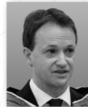
Anthony Simpson Ambassador of New Zealand to Montenegro