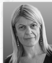
Sanja Damjanović Minister of Science of Montenegro