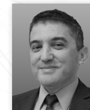
Mirsad Bibović Ambassador-at-large at the Ministry of Foreign Affairs of Montenegro