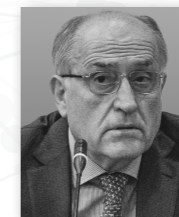
Milan Roćen Founder of Summer School and former Minister of Foreign Affairs of Montenegro