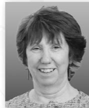
Catherine Ashton Former High Representative of the EU for Foreign Affairs and Security Policy