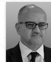
Srđan Darmanović Minister of Foreign Affairs of Montenegro